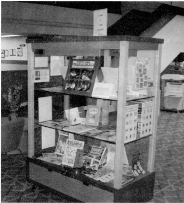
Display cabinet at North York Central Library