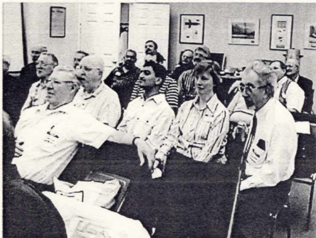
Alliance members listen attentively...we have no idea to whom!

The meeting then turned to the business at hand, with the reports of the president, treasurer and secretary being read to the Board and guests. You will recall that all members of the seven clubs had been invite to this special meeting, about 20 accepted the invite and arrived at the V. Greene Research Foundation to join the Board for the evening. The President's Report is available for anyone to read, on the Alliance's new web-site which, as I write this piece, is expected to go on line by the end of August. Noteworthy in the secretary's report was the approving of the amendment to the Constitution, formalizing a new category of membership in the Alliance, the "Friends of the Alliance." (There will be more about this important addition to Alliance memberships, in the next PhilaJournal).